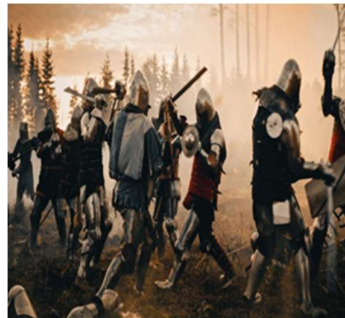
SPACT - London