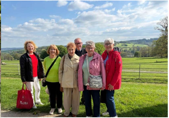
Some stood around looking decorative while others took off into the wide yonder to discover the larger sculptures.